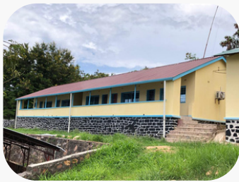
FISHERIES OFFICE BLOCK

Lake Tanganyika Development Project in Mpulungu.