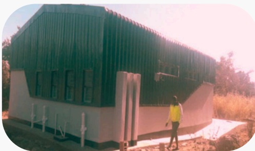
CASSAVA BULKING CENTER